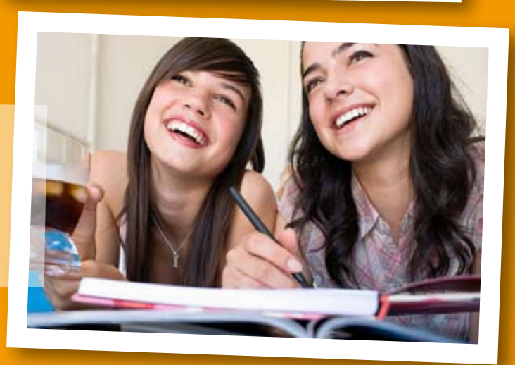
Me and my best friend – always laughing about something